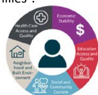
Social Determinants of Health 7